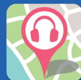
Old town Spandau